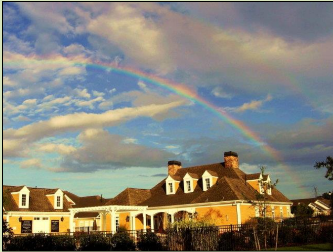
The Retreat Clubhouse